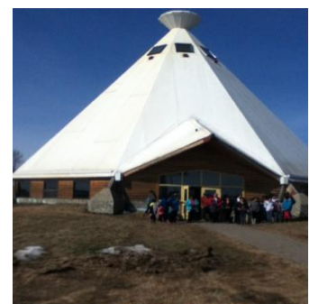
St. Joseph's church in John D'Or Prairie with some of the parishioners who attended the Easter Sunday

Archdiocese of Grouard-McLennan Pilgrimage