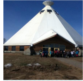
St. Joseph's church in John D'Or Prairie with some of the parishioners who attended the Easter Sunday

Archdiocese of Grouard-McLennan Pilgrimage