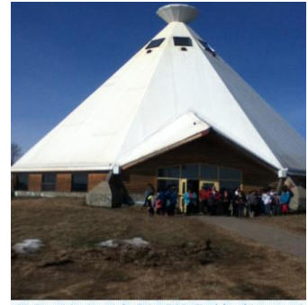
St. Joseph's church in John D'Or Prairie with some of the parishioners who attended the Easter Sunday

Archdiocese of Grouard-McLennan Pilgrimage