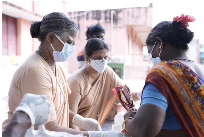
Development and Peace-Caritas Canada says all donations to their appeal in India are desperately needed at this time.

Some of Caritas India's efforts include bringing food to distribution centres and to impoverished communities, as well as sanitizer and hygiene materials. They also donate equipment and resources to Church-run clinics and hospitals in India. As well, they fund and organize public education campaigns to help people know where they can get vaccinated or access other health care resources.