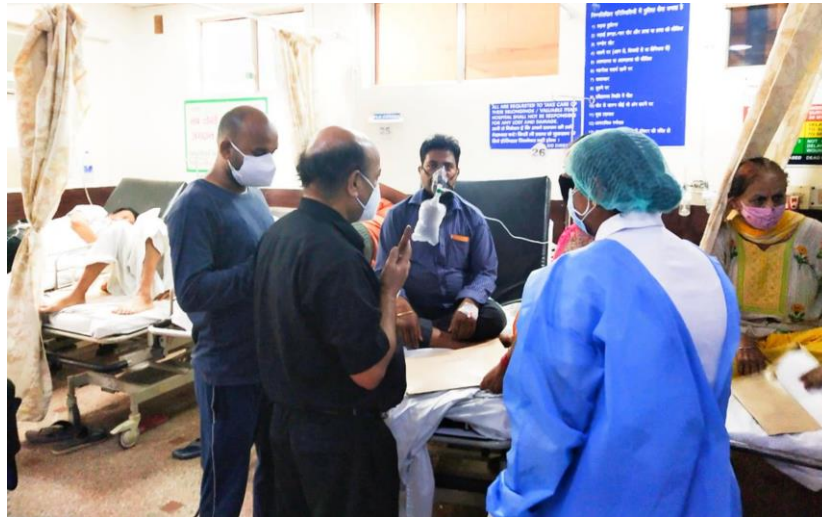
Caritas India has several initiatives in place to help people through the COVID-19 pandemic.