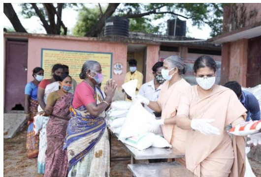
With the help of donations from Development and Peace-Caritas Canada, Caritas India provides food, medical supplies and hygiene materials to poorer regions of India.