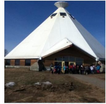
St. Joseph's church in John D'Or Prairie with some of the parishioners who attended the Easter Sunday

Archdiocese of Grouard-McLennan Pilgrimage