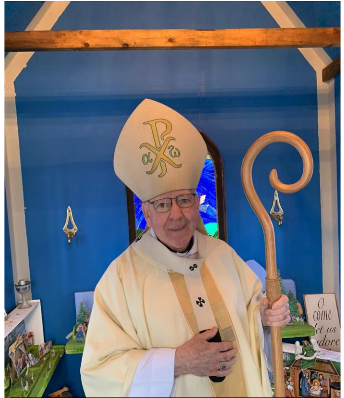
Little Family Chapel ~ Rio Grande

Thanks to everyone who participated in Archbishop's Canonical Visitation to our parishes.