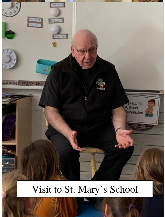
Visit to St. Mary's School