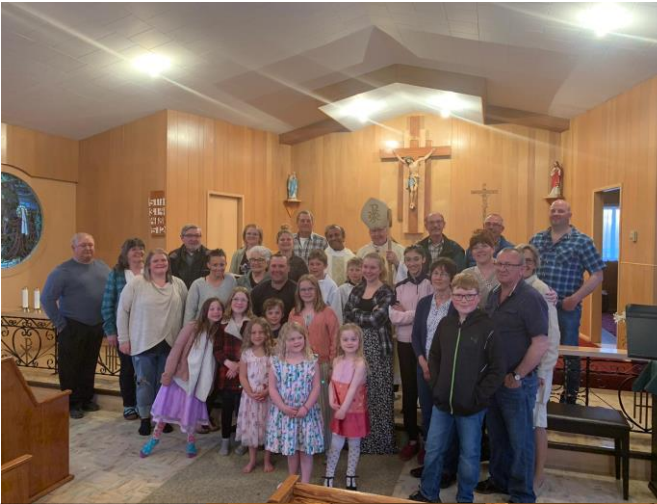
Above The Archbishop's visit with the parishioners of St. Patrick, Rio Grande